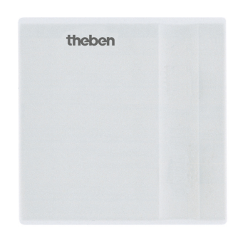
Actuator ALPHA 5 230 V